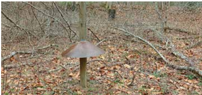
Pond 4, now dry. Post for nesting box, with drop inlet riser and dam at rear