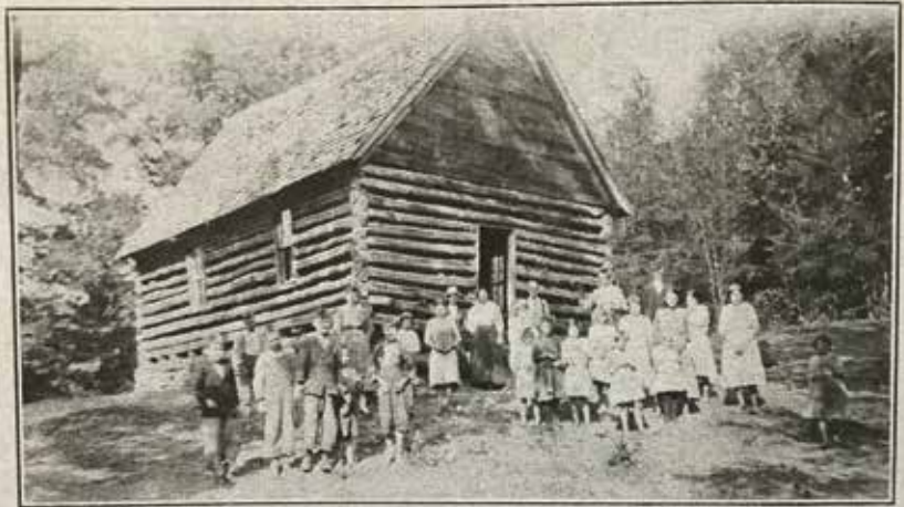
PINE GROVE SCHOOL.

If you would like to learn more about what Towns County Schools were like in 1917 (including photos of the schools), you may purchase the booklet for $8 from the historical society.