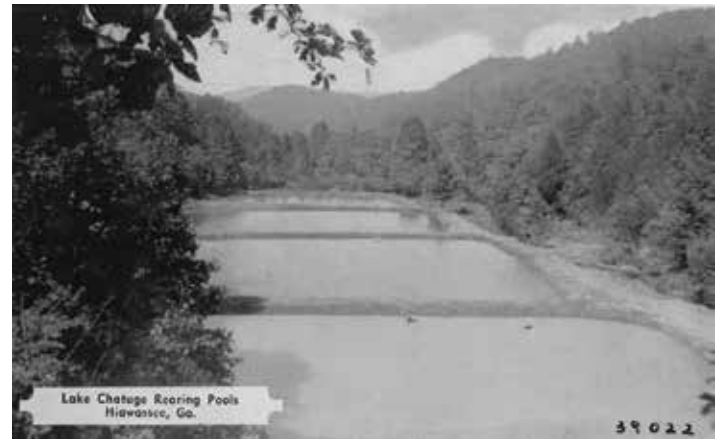
1949 Postcard

A USFS Special Use Permit was approved in August 1948. Apparently only the four ponds currently visible were ever constructed.