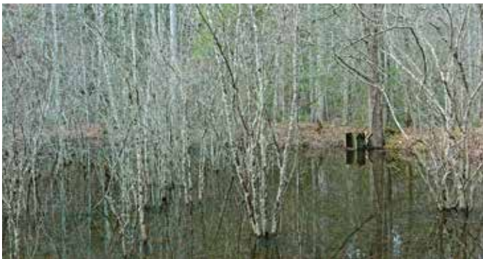
Pond 1, showing drop inlet riser

I hadn't gone very far before I encountered a steep rise in the terrain. It didn't look natural, and after climbing to the top, it appeared to be an old earthen dam. It was covered with trees and blended in with the rest of the woods. There was water behind it, and among the trees that were growing in the water, I noticed a small concrete structure. A closer look revealed what looked like a drop inlet riser (spillway inlet) for a pond.